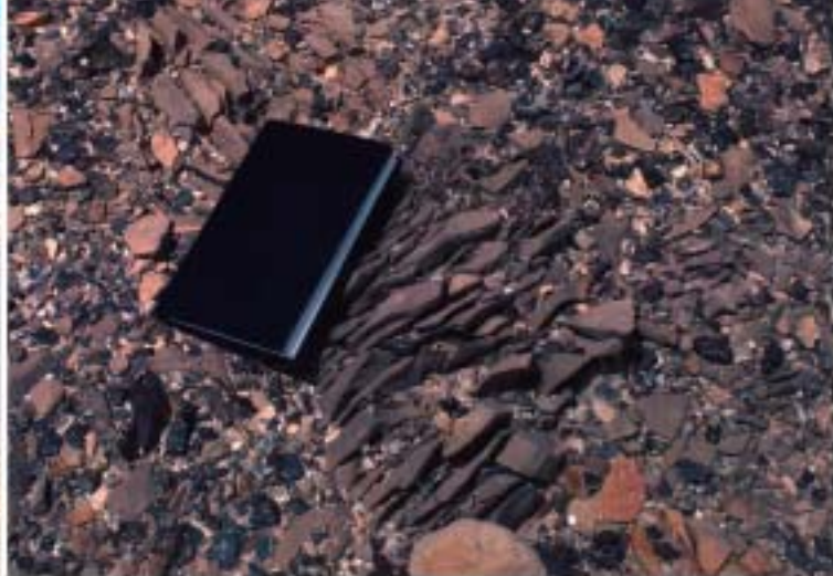
Clinopyroxene and Plagioclase Crystals in Olivine Basalt